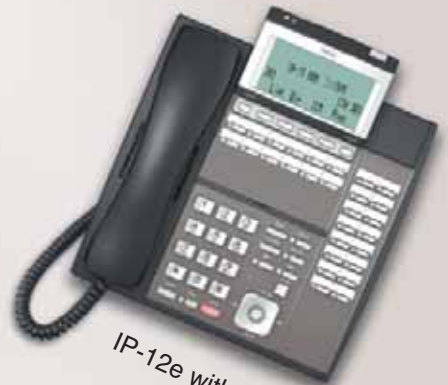
IP-12e with DLS