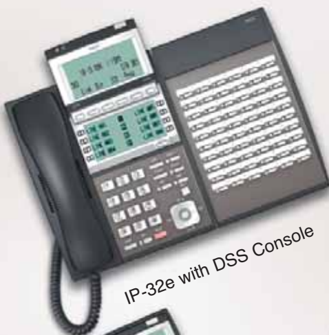
IP-32e with DSS Console

The UX5000 offers an impressive array of high-performance IP and digital proprietary terminals. Choose from display and non-display, handsfree or full-duplex handsfree models. Select models offer backlit display and illuminated dial pad. All features not available on all models. Description depicts an enhanced IP Terminal.