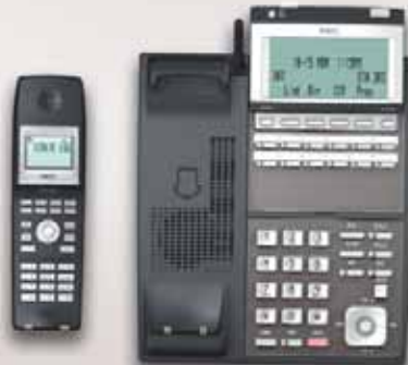
IP-12e with Bluetooth Cordless Handset